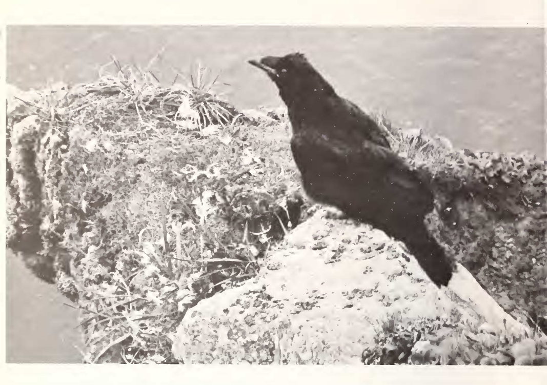
Fig. 22. Common raven at a spot used for roosting and eating prey captured along the seabird cliffs at Cape Peirce.